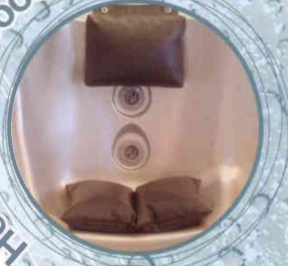
Head Rest & Booster Seats

Our booster seats are ideal for smaller people when the spa is just too deep. All colours are available.